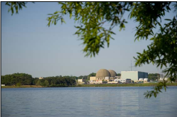
Located in northeastern Louisa County, the North Anna Power Station provides clean, efficient Nuclear power to more than 450,000 homes and businesses in Virginia.